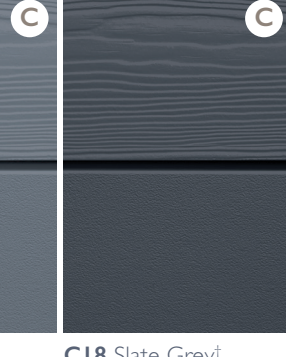
C18 Slate Grey<sup>†</sup> (RAL 7024)